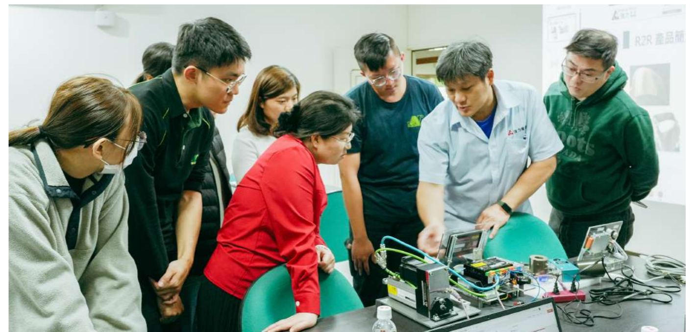
The technical engineer from ChiangLy Trading explained the functions of the control component to Nicely.

As Nicely approaches its 40th anniversary, we congratulate them and wish continued success and a future of great achievements!